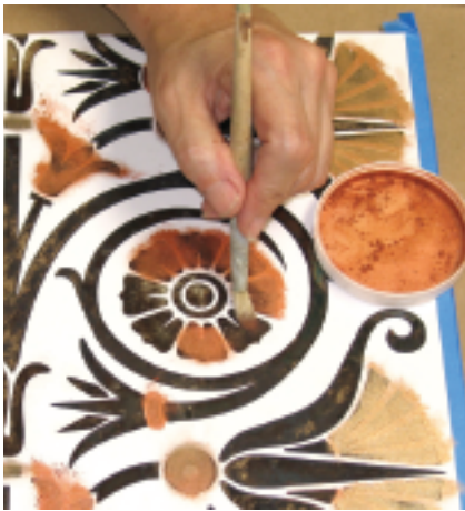
This illustrates flash gilding with mica powders in an area that has received medium patination.