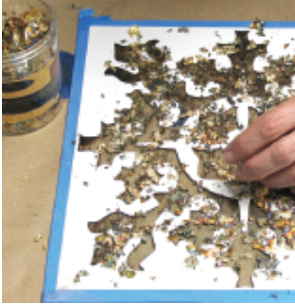
Tamise leaf flakes are applied to the design area following removal of the electroplated surface.