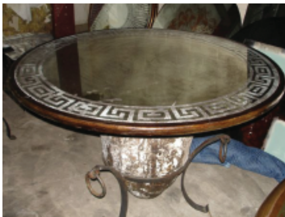
Timothy Poe created this patinated custom tabletop with a Modello Designs border.

ly framed and hung, or permanently mounted with mirror mastic. They can be mounted with mirror clips, or interesting alternatives such as drawer pulls or other substitute clipping devices.