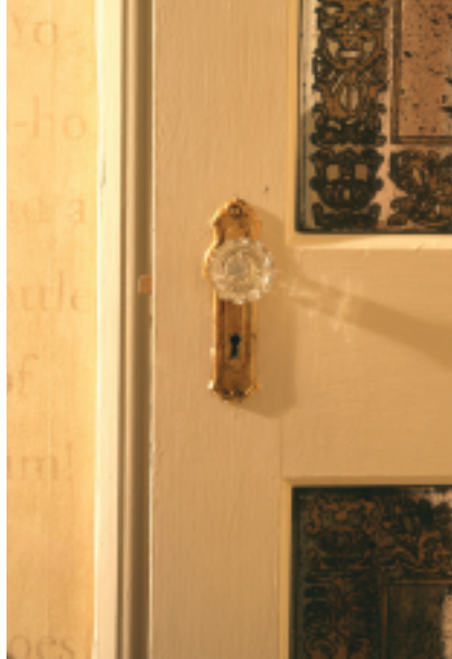
This custom Modello was created for The House That Faux Built project. Artist and designer: Amy Ketteran

The Modello will mask off a design area and allow you to distress or remove the electroplated surface to the desired level and then reapply color to that area in the form of paint, metallic paint, spray paint, metal leaf or mica powders to create numerous different decorative effects. Because the effects are created on the reverse