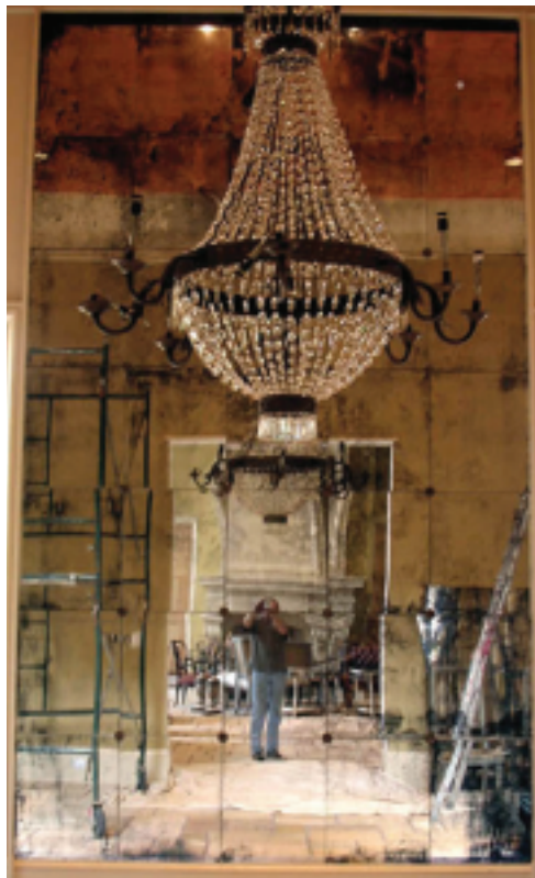
Patinated mirror panels by Timothy Poe.